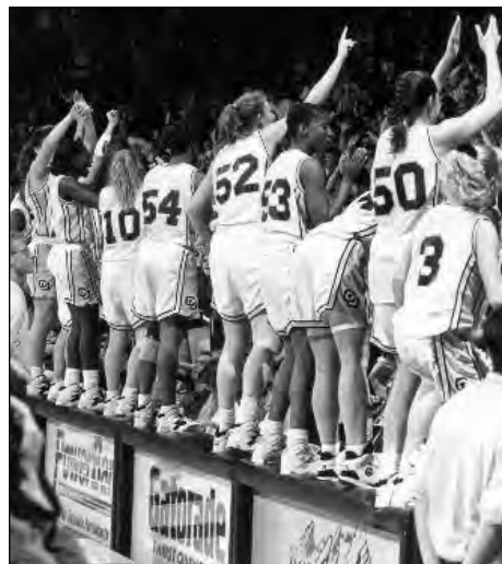
CU celebrates another NCAA Tournament win.