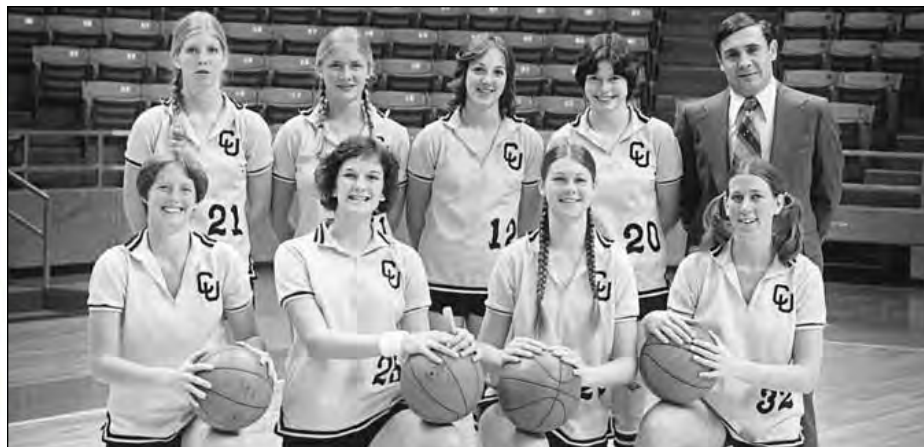
Colorado's 1977-78 team was its winningest to date, with an 18-14 mark.